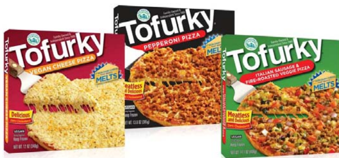
Three new Tofurky Vegan Pizzas: Cheese, Pepperoni and Italian Sausage and Fire Roasted Veggies.